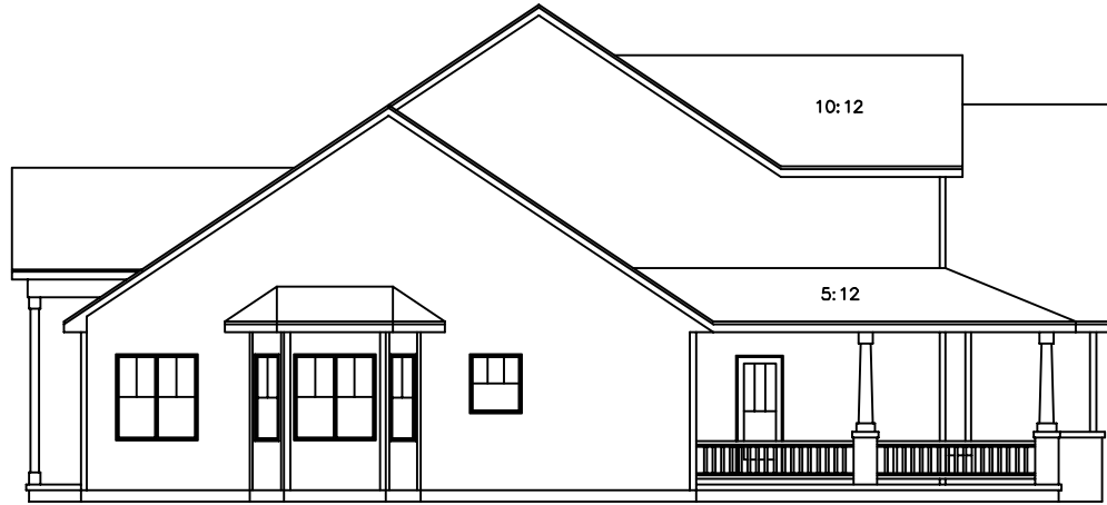
LEFT SIDE ELEVATION SCALE: 1/8" = 1'-0"