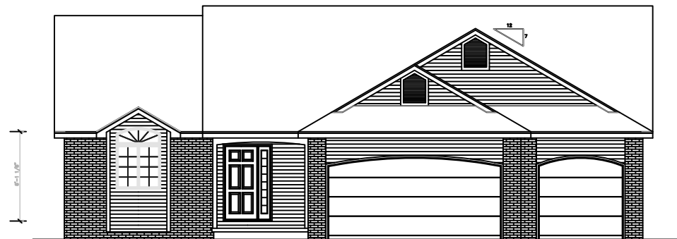
FRONT ELEVATION SCALE 1/4" = 1'-0"