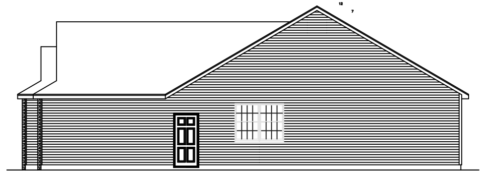
RIGHT SIDE ELEVATION SCALE 1/4" = 1'-0"