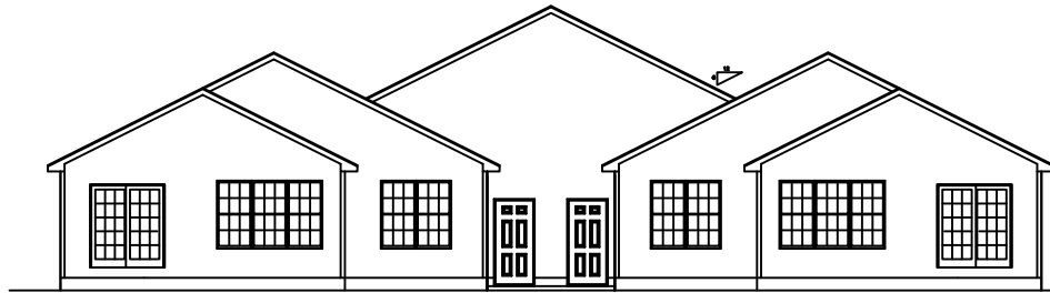
REAR ELEVATION SCALE: 1/8"=1'-0"